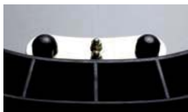
Impact absorbing edge