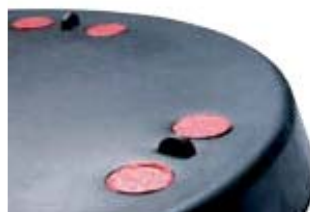
Longer life chain pivot